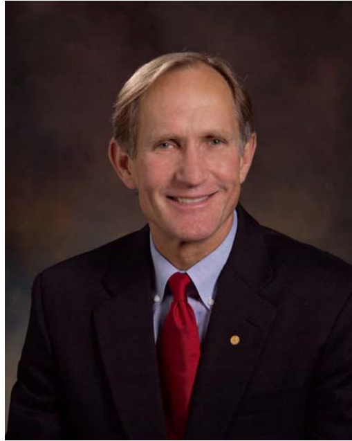
Peter C. Agre, M.D.

Vice Chancellor for Science and Technology Professor of Cell Biology and Professor of Medicine Duke University School of Medicine Durham, NC